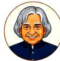
Dr. A.P.J. Abdul Kalam